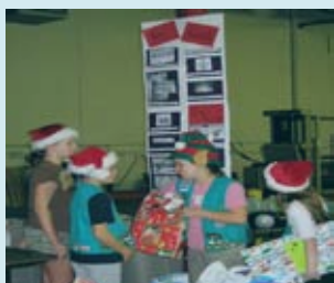
Volunteers following every safety precaution at the Toy Recall station