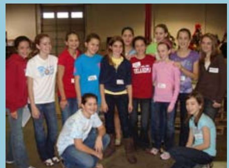
Young volunteers donating their time and holiday spirit