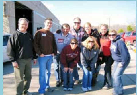
99.5 The Wolf volunteers at the warehouse

Without the support of many friends we never could have served so many children!