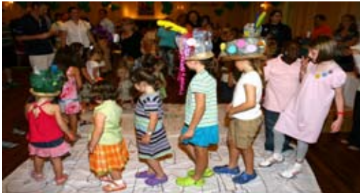
A great time at the Cake Walk

Our inaugural Change is Good event was a huge success! Just by collecting coins, the kids in attendance brought in over $5,800 which equated to more than 83,000 coins!! The September 30 event held at Brook Hollow Golf Club included dinner, entertainment and games for the entire family to enjoy. Plus, kids who collected change were able to win great prizes.