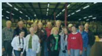
White Rock United Methodist Church volunteers at the warehouse

99.5 The Wolf CPS Caseworkers Enchanting Light Ericsson Inc Girl Scouts Troop 1058 Group & Pension Administrators Greenhill School Insurity Jesuit Preparatory School Junior League of Dallas Kraft Foods National Charity League